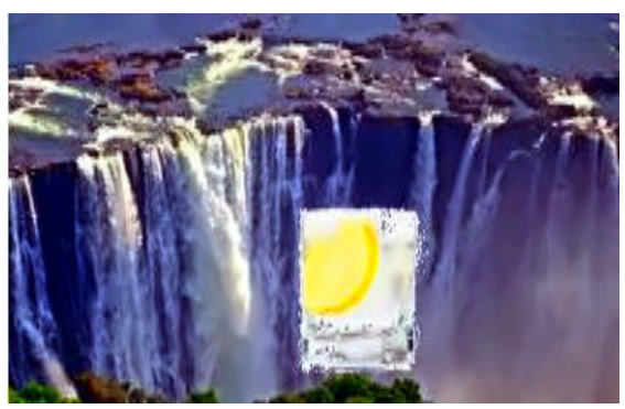
Filtered Water for good Health!!!