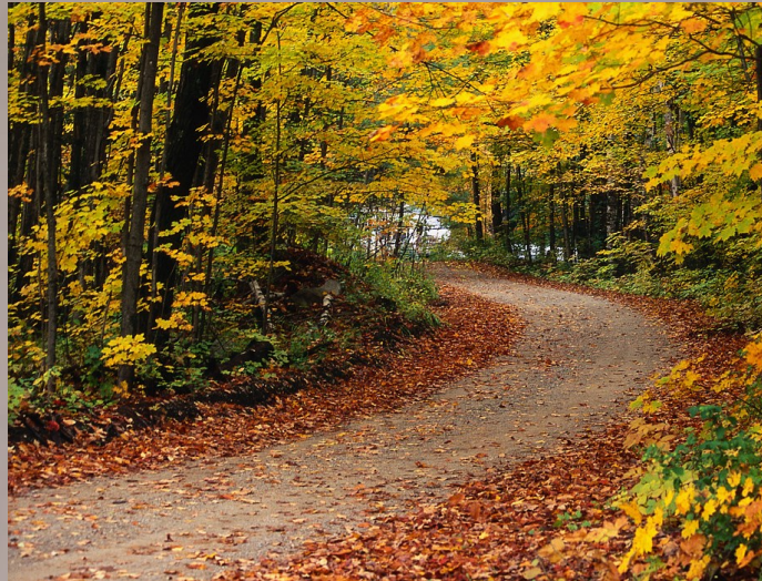
Many times one sin can lead to more sin and we start down a path that is going the opposite direction to God. To repent is to change your mind and change your direction, so we can turn around when we come to ourselves and return to God. The path back may be long—to be in that position of blessing and fellowship we once were, but whosoever comes to Jesus He in no wise will cast out.

Isn't it wonderful to be walking with God? Since we always sin (some sins are worse than others) we will always be walking that road to righteousness, but we can have fellowship with God along the way.