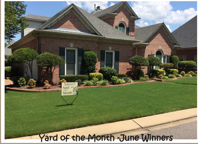
Charles & Wanda Adams 586 Warwick Willow Lane!

Tips for Saving Water • Don't over water your lawn. • To prevent water loss from evaporation, don't water your lawn during the hottest part of the day or when it is windy. • Use a broom, rather than a hose, to clean sidewalks and driveways. • Repair dripping faucets and leaky toilets. Dripping faucets can waste about 2,000 gallons of water each year. Leaky toilets can waste as much as 200 gallons each day.