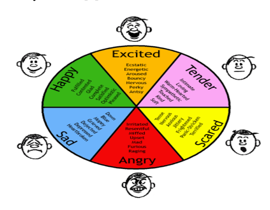
Fig.1: Sentimental analysis [3]

of certain policies[4]. Some advantages of sentimental are ability to adapt & create trained models for specific purposes and contexts, Wider term coverage, Lexicon/learning symbiosis, the detection and dimension of sentiment at the impression level & the lesser sensitivity to changes in topic domain. And there are some drawbacks of sentimental analysis are like low applicability to new data because it is necessary the availability of labelled data that could be costly or even prohibitive, Finite digit of words in the dictionaries & the meeting of a fixed sentiment orientation and score to words Noisy reviews[5].