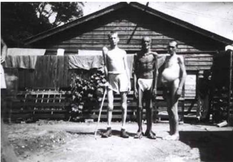
Fukuoka POW Camp 3

The South Korean government's Truth Commission on Forced Mobilization under Japanese Imperialism continues to demand, thus far with limited success, name rosters and data about human remains from Aso Mining's successor company and the other firms. "The corporations' remains survey has been insincere," a Seoul government official charged last November. "It is also strange that the family company of the foreign minister, which should be setting an example, has provided no information whatsoever."