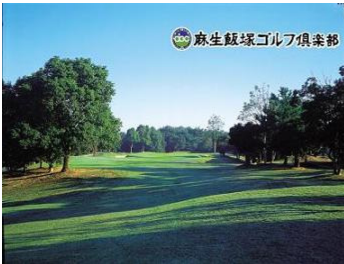
Aso Iizuka Golf Club, near the former Yoshikuma mine site

About 20 priests, 60 local residents and a nephew of a deceased U.S. POW whose ashes were once held at the temple also attended the service. Foreign embassy officials stayed away as requested.