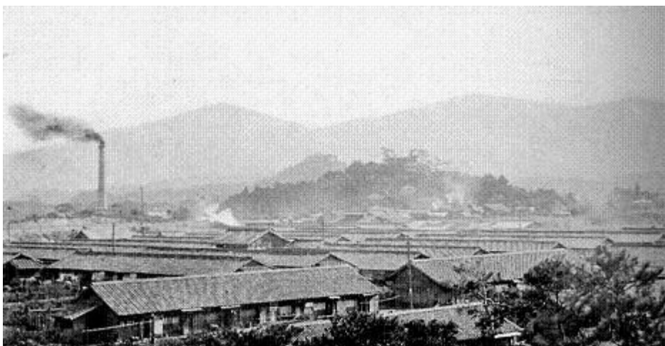
Undated photo of work camp at Aso Yoshikuma coal mine, Fukuoka

“While our feelings of deep remorse and heartfelt apology are no different towards British, Dutch and American POWs, the circumstances surrounding the POWs are different with each country and no similar program currently exists for the former American POWs,” wrote the Japanese Embassy in response to the inquiry. Redress movements for all classes of forced labor in wartime Japan, far from abating, are being reinvigorated—due in part to the family background of the man now serving as Japan’s official face to the world.