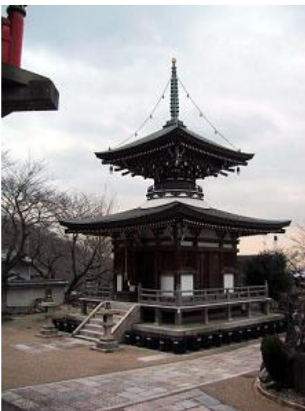
Juganji temple near Osaka

"His attendance has already been highly politicized by the media, and Aso apparently decided not to cause further turmoil by involving ambassadors," said a senior Foreign Ministry official who accompanied his boss on Monday.