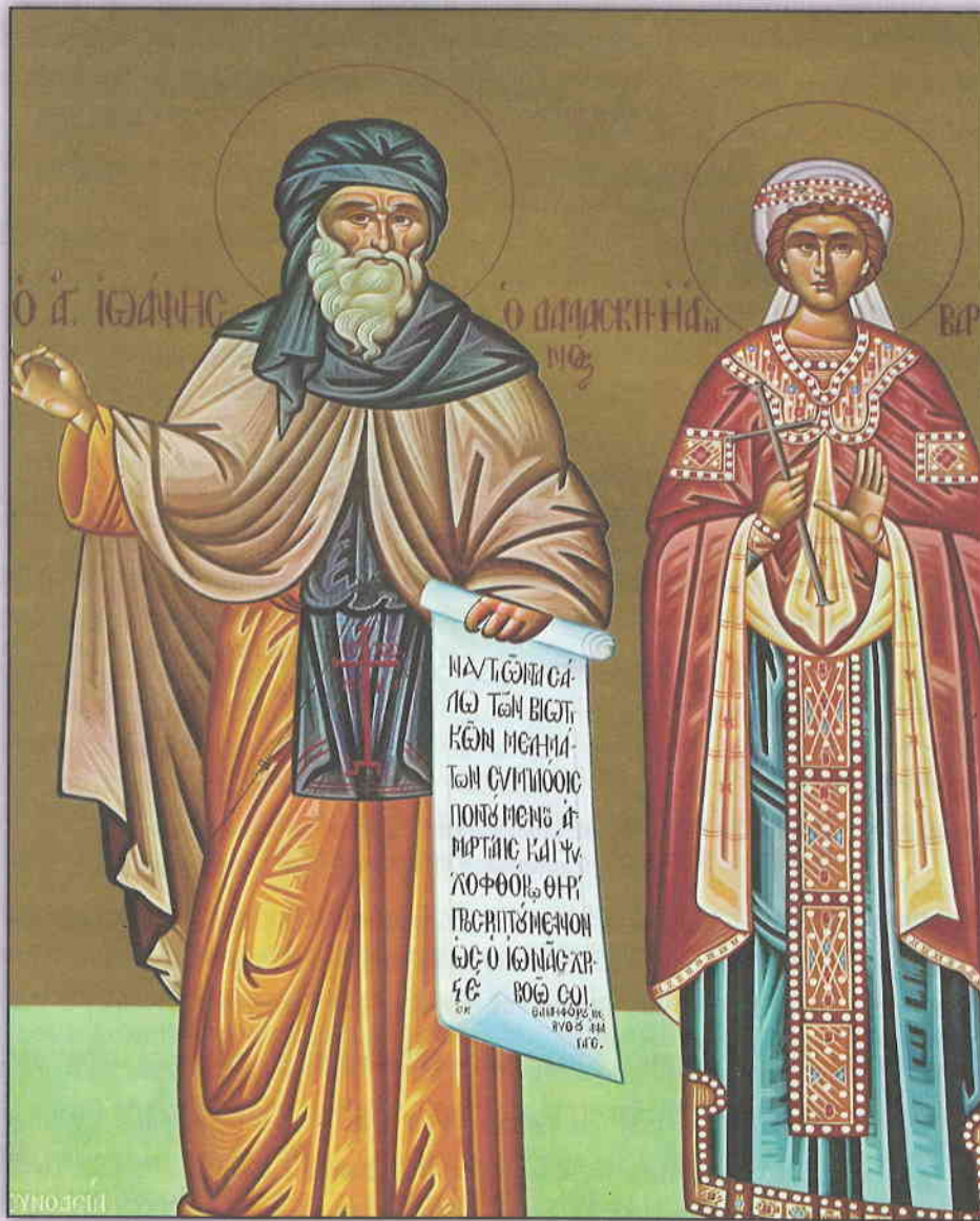
Icon of Saint John of Damascus and Saint Barbara -- December 4th