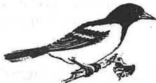
Northern (Baltimore) Oriole