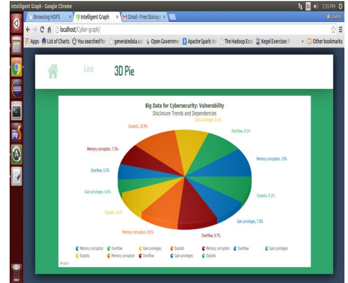
Figure 2: Graphical representation of Vulnerabilities

We have demonstrated that a copula based displaying methodology can successfully recognize and save dormant reliance arrangement in multivariate time arrangement information. By applying it to a true digital security situation, we can pick up a superior comprehension about how unique defenselessness and adventure divulgences cooperate with each other through rich recorded information