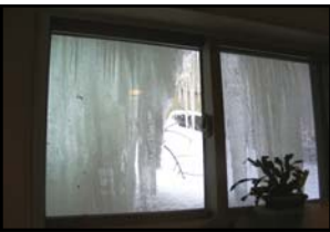
Looking out the Office Window One BIG sheet of ice

At the end of March Holiday Beech had $2985.00 in delinquent fees. Due to the foreclosures of units D111 and E317, $3925.00 is an additional delinquent amount (including the Special Assessment payments) which is, unfortunately, unrecoverable. The two foreclosed units are on the market and can be found on the For Sale section of the website.