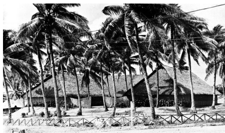
Typical camp on Guam