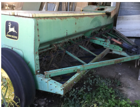
John Deere 8300 23 hole drill