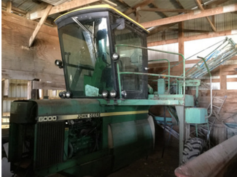
John Deere 6000 60' sprayer