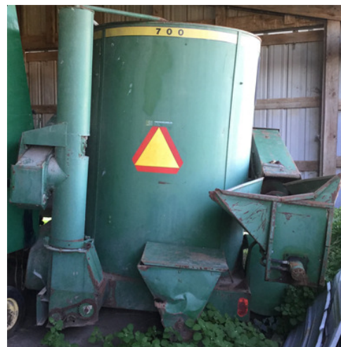
John Deere 700 grinder-mixer Mity Handi 60'x8" auger John Deere 346 square baler