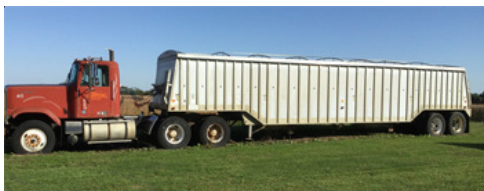
1984 GMC General Class 8 truck, 350 Cummins, 9 spd, spring ride, shows 42k miles Cornhusker 42' hopper bottom grain trailer