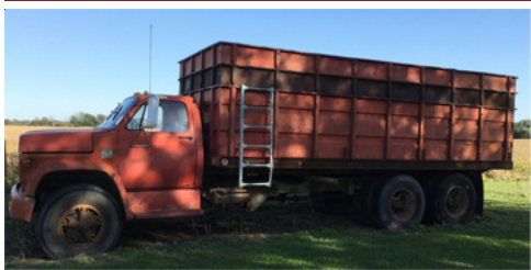
1973 Chevy Grain truck, 427 5/2 spd, air brakes, tag axle, shows 53k miles, 20' grain box with wood floor Dodge 600 fertilizer truck, needs repair