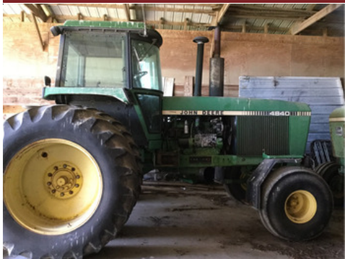
John Deere 4840, duals, cab, 6 remotes, fast hitch tac shows 9642 hrs