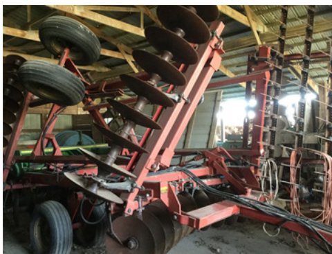
Case IH 3900 20' disk John Deere 400 15' rotary hoe Case 6 bottom semi mount plow Case 5 bottom semi mount plow 2- Case chisel plows