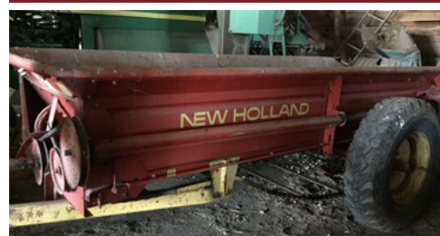
New Holland 329 Manure Spreader 14' Grain box on 1966 Chevy chassis 3 pt John Deere 7' brush cutter for scrap Creep feeder Several John Deere front end weights 1100 gal Stainless tank w/pump Grain Bin, metal is crimped Several gates Feed troughs John Deere 216 mower, needs repair Troy Bilt pony tiller Poly Stock tank Pellet stove Oak Lumber, 2x10, cured