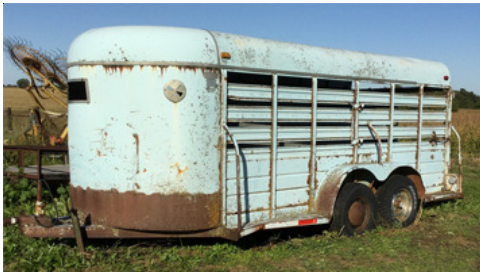
1988 WW 16' stock trailer 16' Flatbed bumper trailer 20' Wagon w/ metal screen bed