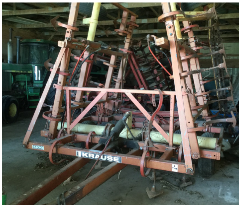
Krause 4100 24' Field Cultivator Krause 1900 21' fold-up disk John Deere RM 16' Cultivator, 3 pt