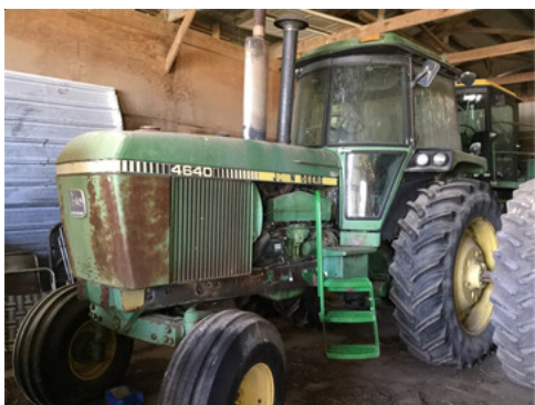
John Deere 4640 cab, duals, 4 remotes, shows 16619 hrs