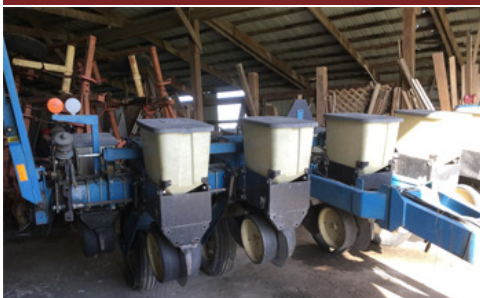
Kinzie 6 row planter