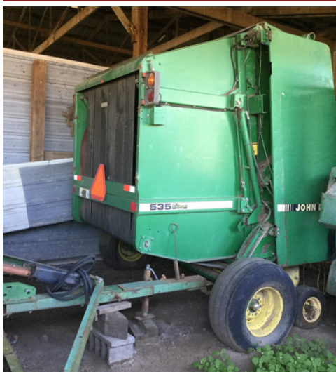
John Deere 535 big round baler