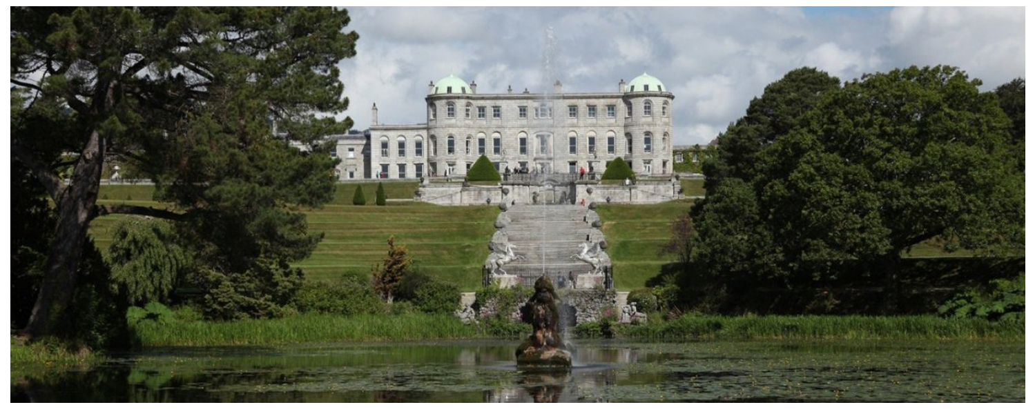
Day 6: Tour Ends, Tuesday, March 19

End of services this morning. The shuttle will bring you to the airport after breakfast. (B)