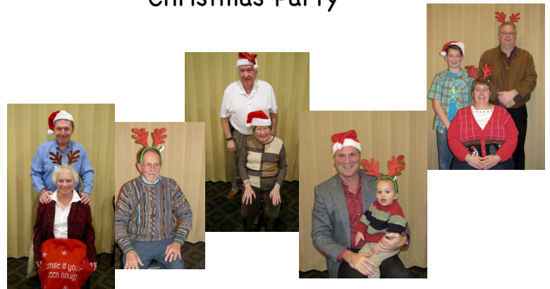
Above: in festive costumes