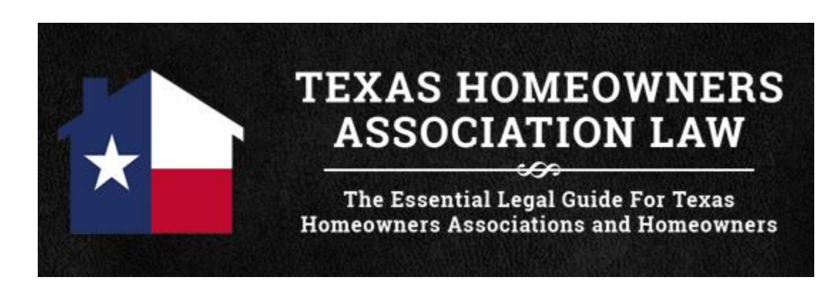
Legislative Updates from the Texas Homeowners Association Law

Senate Bill 1588 adds Section 209.017 authorizes property owners to sue a property owners association that administers a subdivision development in justice court for violations of Chapter 209 of the Texas Property Code.