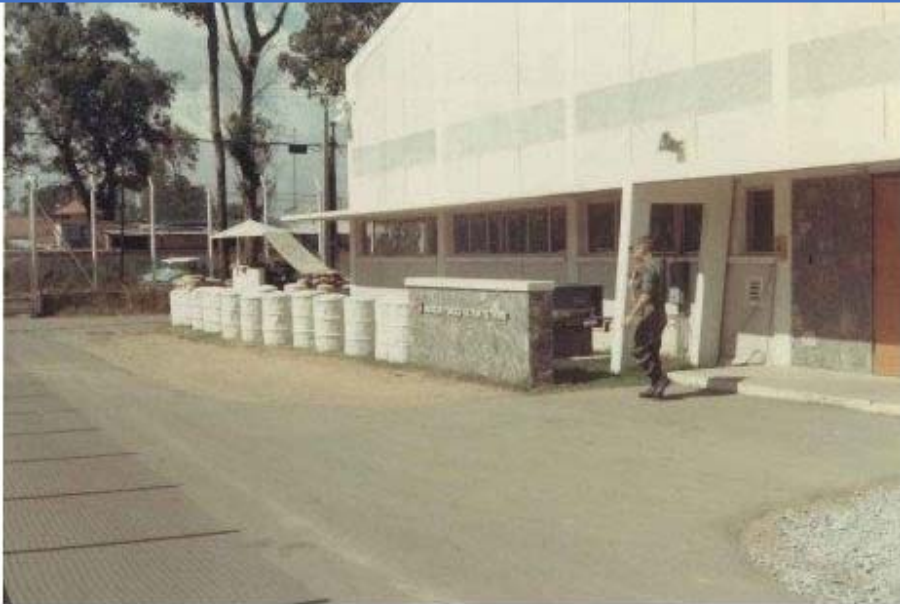
The Main Entrance