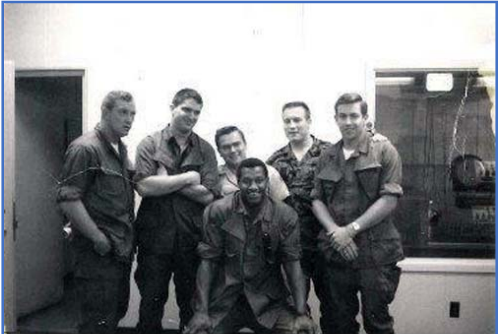
Possibly some of the men in the Newroom in 1967-68?