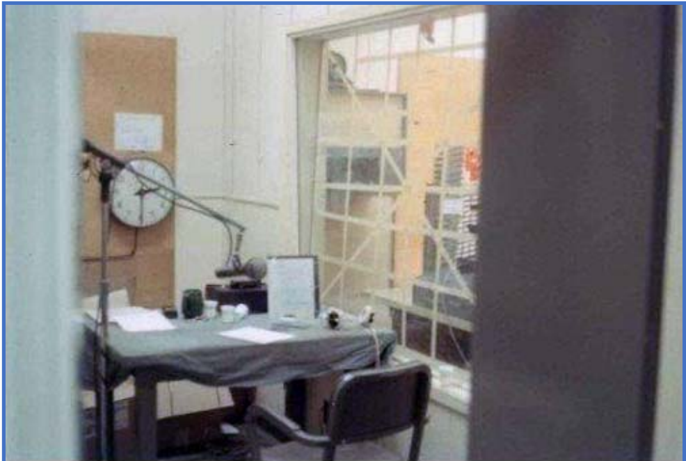
The Radio News Broadcasting Booth?