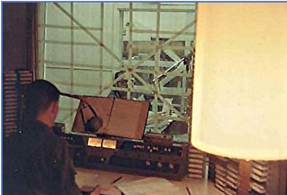
The Radio Studio.