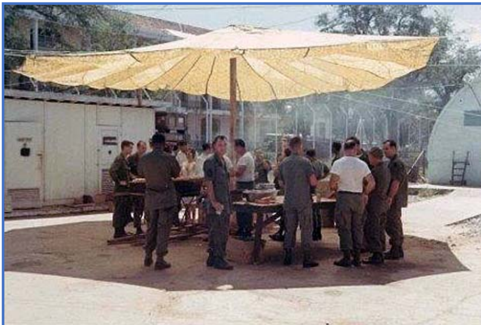
An AFVN party out back.