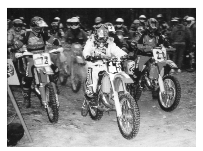
An early row takes off.

Once again I want to say THANK YOU to everyone involved and I look forward to the 33<sup>rd</sup> annual Chadwick Enduro on October 22, 2000.