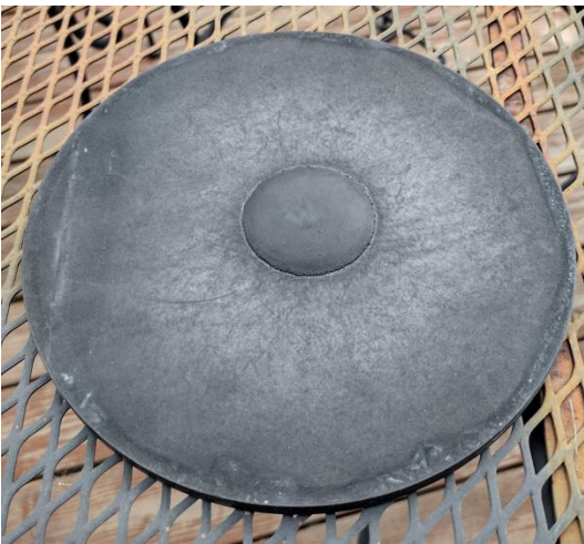
Patch on the inner gasket