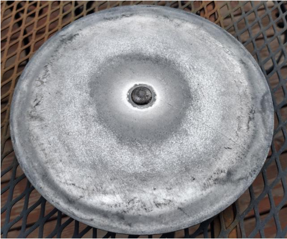
Patch on the inner gasket