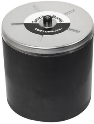
Lortone QT12 tumbler