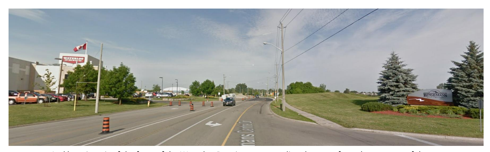
And here is a pic of the front of the Waterloo Brewing company directly across from the entrance of the Conference Centre

The entrance to the conference centre is directly across from Waterloo Brewing Company and looks like this (depending which side of the road you are coming from):