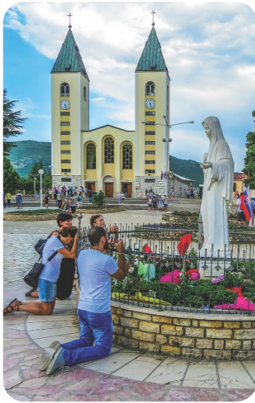
PRAYING IN FRONT OF THE STATUE OF OUR LADY MARY, MEDJUGORJE, BOSNIA AND HERZEGOVINA

It is important to note whether the private revelation is contrary to the faith or the morals of the Church, and whether a particular revelation brings one closer to God. ●