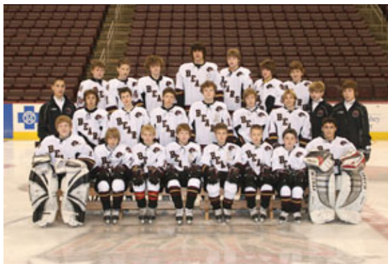
Hershey Quebec 2006-2007