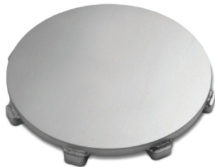
PLATE PERIMETER DRAINAGE GRATE

Engineering Specification: 12" FLOOR DRAIN .Construction 304 Stainless Steel Body; Traffic Grates; Sediment Basket.