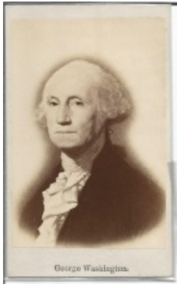
George Washington (1732-1799)

When Washington arrives back home on March 15, 1797, he finds that the time and devotion he has put into the presidency has left Mt. Vernon in need of fundamental repairs, almost top to bottom. What follows is a daily influx of carpenters and painters and groundskeepers, all working long days to meet the master's commands. But soon enough, his step-granddaughter, Nelly Custis, reports that: