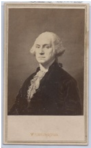
George Washington (1732-1799)

Madison in particular senses threats here to national unity, and he persuades Washington to accept a second term rather than retire to Mt. Vernon, which is his stated preference. Some worry that this will lead on to monarchy, but the fact that Washington is without children quells this fear.