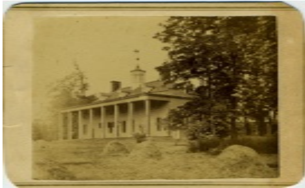
A Front View of Washington's Beloved Mt. Vernon

He also finds himself being drawn back into the controversy surrounding what the Democratic-Republicans argue was his favoritism for Britain over France. This has long been a cause celebre for men like Jefferson and Monroe, and Washington now encounters various pamphlets and messages he finds dismaying. He is particularly upset once again with Monroe, saying in a letter that he has exhibited a: