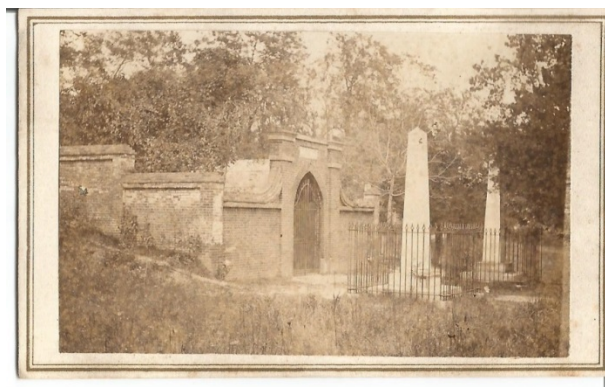
Washington's Burial Site at Mt. Vernon

With those words, the General passes. Elaborate memorials honoring Washington's death will follow across the nation, but on December 19, a simple ceremony, organized by his local Masonic Lodge, carries him to a final resting place on his farm.