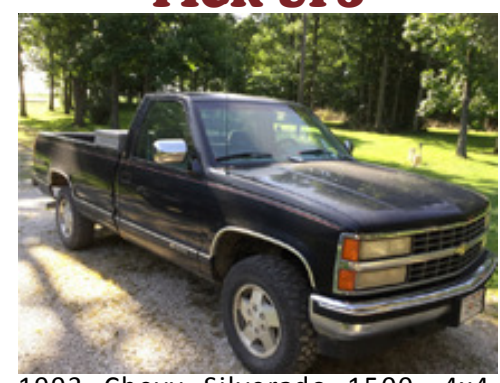
1993 Chevy Silverado 1500, 4x4, automatic, 126,750 miles, 2nd owner