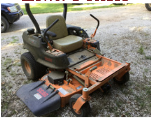
Scag Freedom Z 52" cut 0-Turn mower Black and Decker 40V trimmer Wheelbarrow Concrete bench Craftsman rear tine tiller Patio furniture