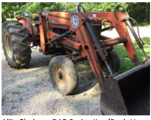
Allis Chalmer D15 Series II w/Bush Hog 2400 QT loader 2 Original tires and wheels from D15 Wheel weights