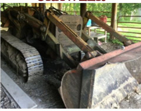
Allis Chalmer HD 5 2 cyl Detroit, runs good Extra track and bucket for HD 5