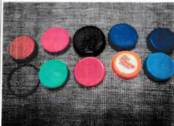
Milk Jug Caps