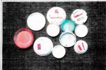
Medicine Bottle Caps with any cardboard inserts removed