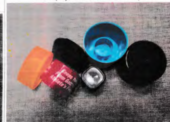
Hair Spray, Paint & Deodorant Caps