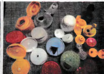
Flip-top caps (ie: Ketchup, Mustard, Creamer tops)