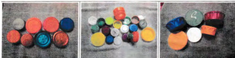
Drink Bottle Caps