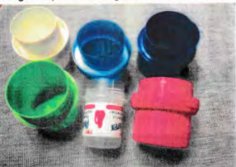
Detergent Caps with white gasket and label removed