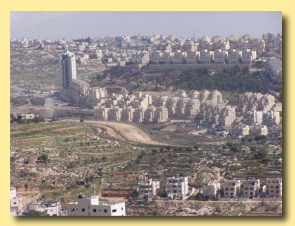
Illegal settlements dominate Bethlehem.