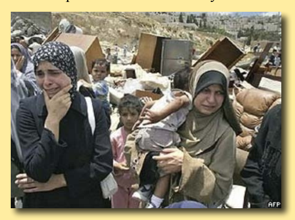
Women grieve near a demolished home.