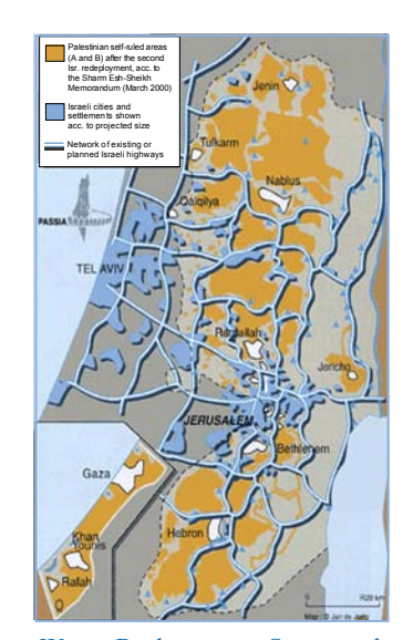
West Bank map: Segregated settlements and roads confiscate land and isolate Palestinians.

These Israelis live in segregated settlements linked by segregated roads that have been built on Palestinian land.