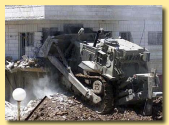
Caterpillar bulldozers destroy homes.