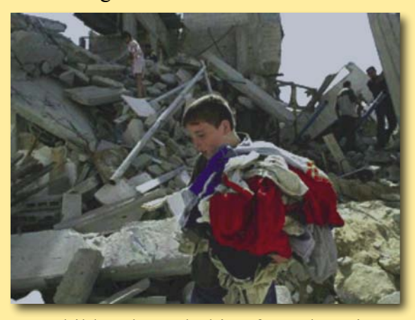
A child gathers clothing from the ruins.

International law forbids an occupying power from moving its own people into areas it occupies. Yet Israel has moved more than half a million of its own citizens out of Israel into the occupied West Bank, taking land, resources and water from Palestinians.