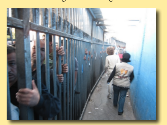
Palestinians wait at HP-equipped checkpoint.