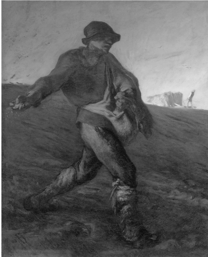
The Sower, Jean-Francois Millet—1850

January 14, 2024 Baptism of Our Lord 9:30 am