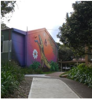
Charlestown South School

We looked forward to finishing our visits to schools in Newcastle as we had surprising success on our visit there two weeks ago. But we had prepared the booklets as usual, hoping to bless the regular teachers in these public schools who are under pressure from children who are having mental health difficulties, and from bureaucrats in the NSW Department of Education, who do not seem to understand what is happening to school children in these days.