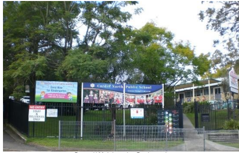
Cardiff North School