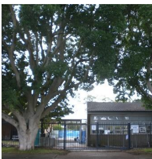
Hamilton South School