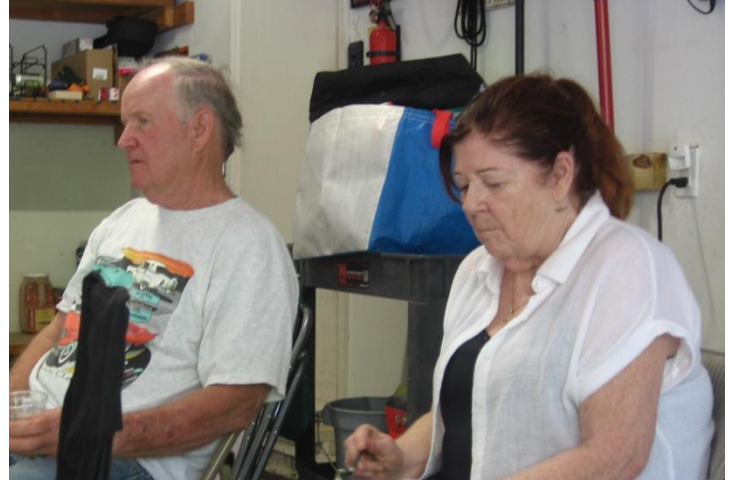
Our Hosts - the top two pictures