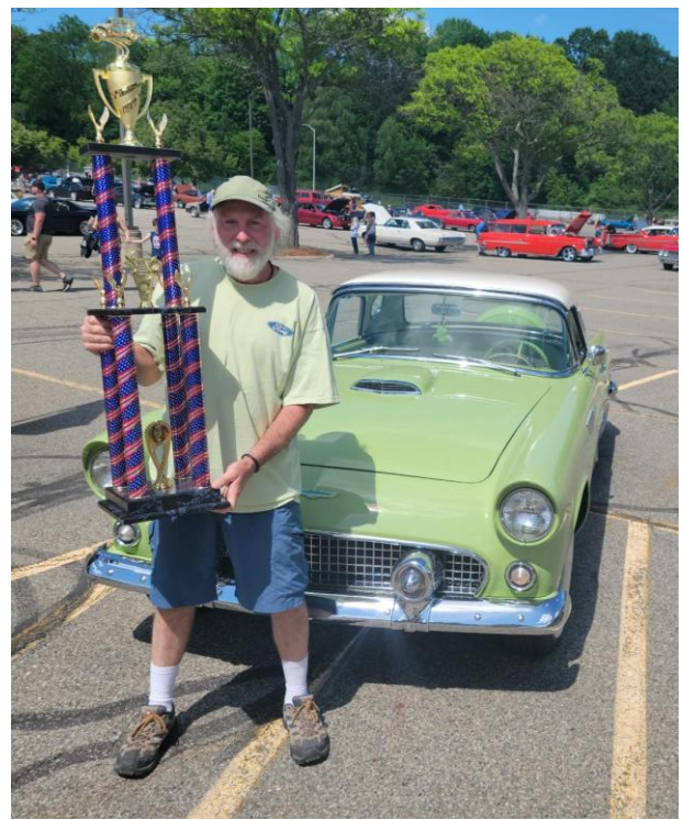
Looks like the battle of the trophies