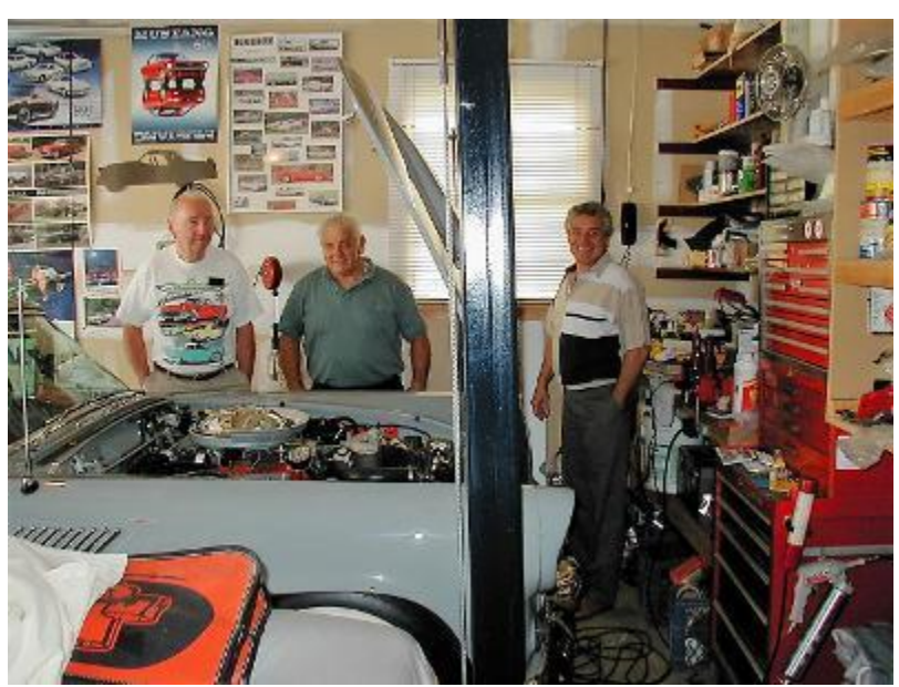
An oldie from 2003