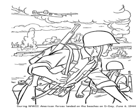
6/6/44 D-Day Always Remember