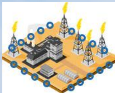
Medium Refinery 750-1500 Acres 18 Locations 20° Placement +/- 1°