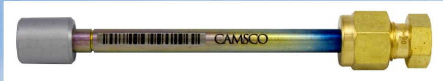
Inert Coated Passive Sorbent tube with Carbopack X 40/60. Passive Sampling Cap and Brass Compression Cap