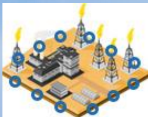
Small Refinery <750 Acres 12 Locations 30° Placement +/- 1°