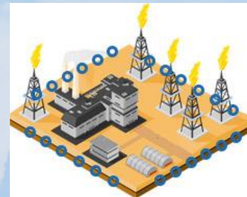
Large Refinery >1500 Acres 24 Locations 15° Placement +/- 1°