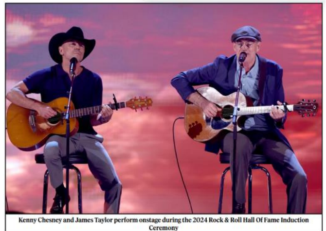
Kenny Chesney and James Taylor perform onstage during the 2024 Rock & Roll Hall Of Fame Induction Ceremony