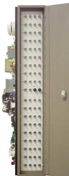
Right side view of H-ACCS-1A showing Fault Switch compartment and lockable access door

The Hampden Model H-ACCS-1A Air Conditioning Control System contains the actual components used in the control of commercial and residential heating/cooling systems. All components are prewired into a complete thermostat-actuated control system and then diagrammed to facilitate understanding and use.