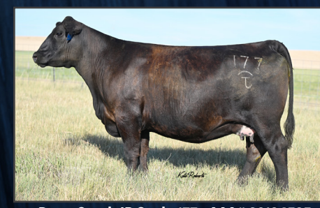
Deep Creek JP Susie 177 - AAA# 20194525