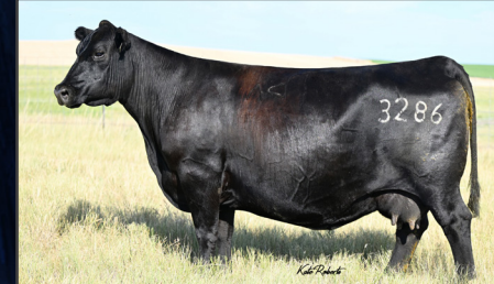
LT Prairie Peak 3286 - AAA# 17671979

Excited to incorporate these new donor females into our program.