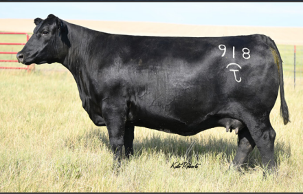
Deep Creek Reno Lass 918 - AAA# 19595788