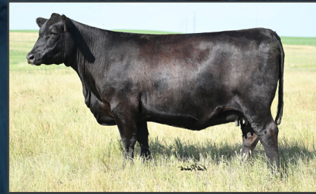
Deep Creek Door Lass 123 - AAA# 20194521