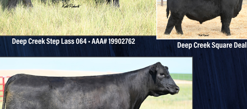
Deep Creek Rain Lass 013 - AAA# 19899127