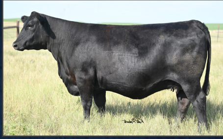
Deep Creek S Blossom 103 - AAA# 20194568