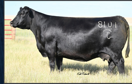
Deep Creek Lady Ida 8101 - AAA# 19294701