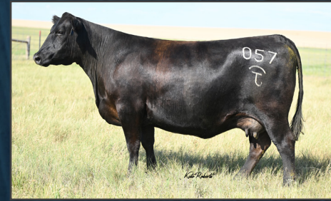
Deep Creek V Blackbird 057 - AAA# 19899075