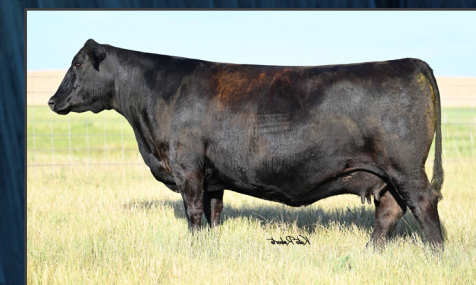
Deep Creek Hunt Lady 845 - AAA# 19294621