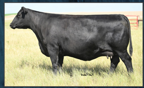
Deep Creek E Blackbird 807 - AAA# 19294700

2024 Sires: Sitz Stellar Sitz Intuition • Myers Fair-N-Square Connealy Reflection • HERB RTZ Bam