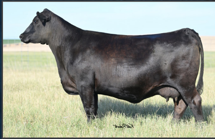
Deep Creek KO Vixen 146 - AAA# 20194548