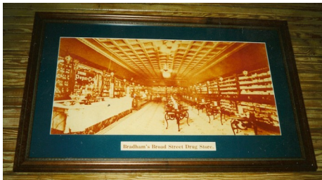
(From a forthcoming issue of the PCCC Express)

Most of us are familiar with Caleb Bradham's first pharmacy. It was the location where he invented Pepsi-Cola and now houses the "Birthplace of Pepsi-Cola" store and soda fountain. But, did you know that he had a second pharmacy in New Bern in addition to the first one, all while running his growing Pepsi-Cola Company?