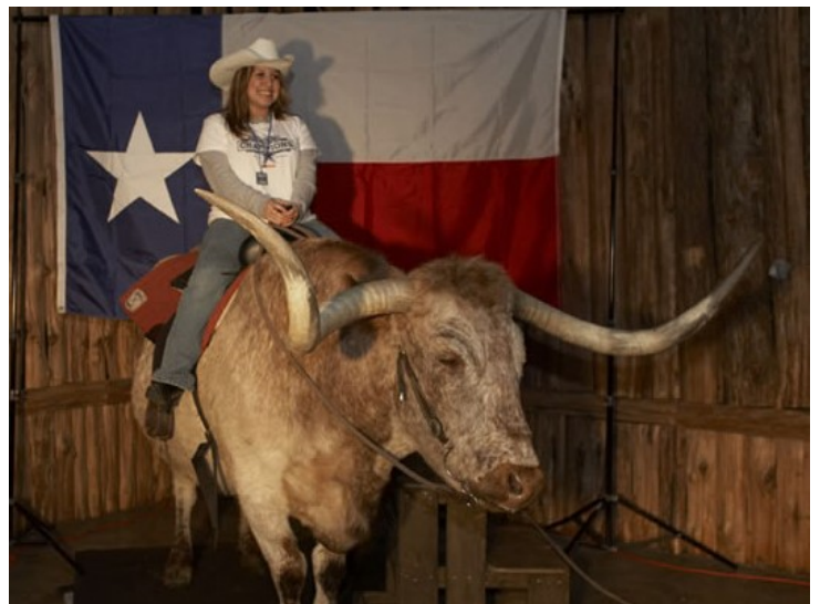
Now its your turn!

A Volunteer list will also be available for you to volunteer. This is also going to be a fun time. Volunteer will be fun and rewarding.