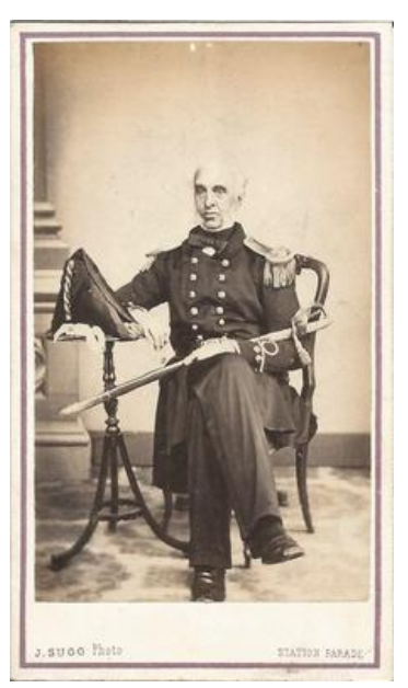
A British Veteran Of the 1812 War

Two days later, on November 14, Coburn finishes an investigation of the rebellion and announces his verdict. Nineteen of the slaves are to be held for possible trial as "pirates," while the remaining 116 blacks are immediately free to depart on their own.