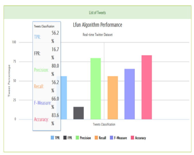
Fig.3: Performance analysis of Lfun Approach