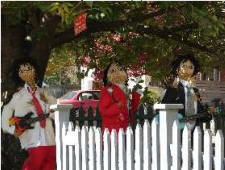
Some of the spectators