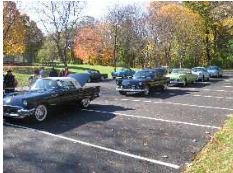
See Page 7 for more pictures