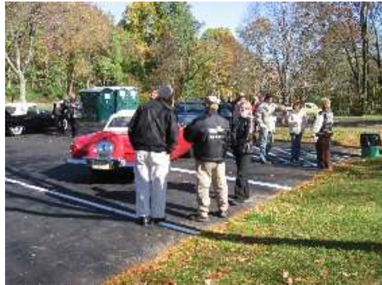
Getting ready for "take off"