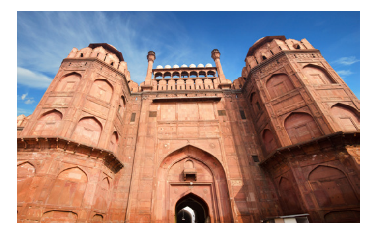
DAY 2: MARCH 8, 2018 Explore Delhi