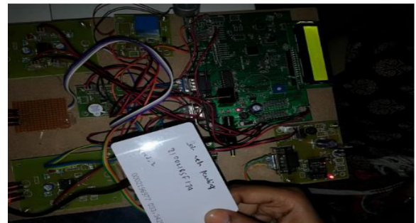
Fig.2: RFID card using for Online registration.