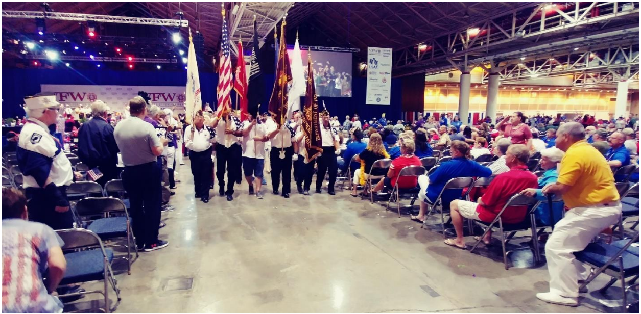
The Flags were in full glory at the Mardi Gras march at the National Convention