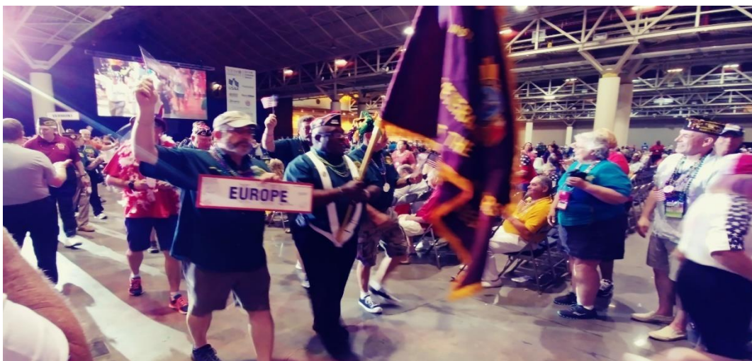
Europe was very enthusiastic at the Mardi Gras march-in Celebration