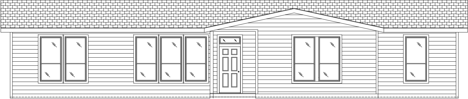
FRONT SIDEWALL W/POD