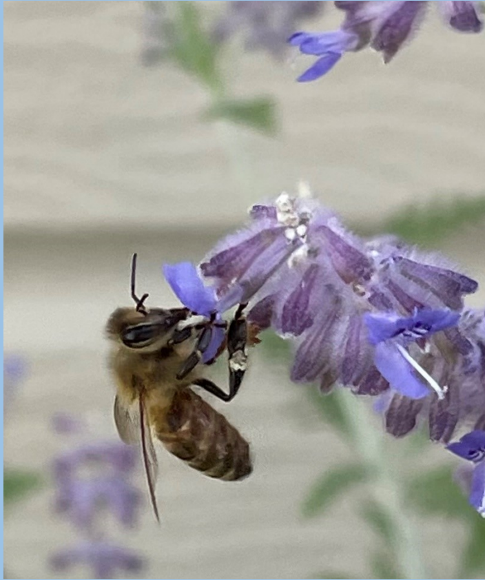
July 12 – Russian Sage, Berryton, KS