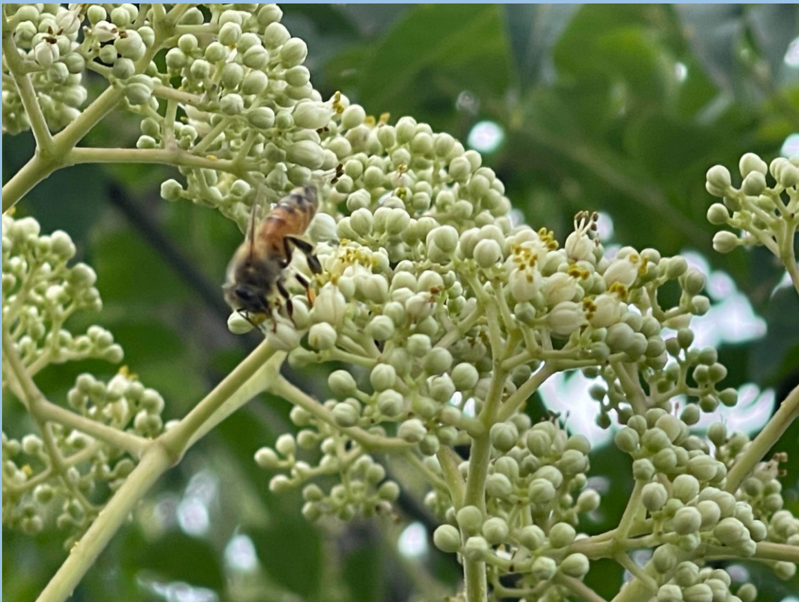
July 29 – Bee Bee Tree (Korean evodia), Ferrelview, MO