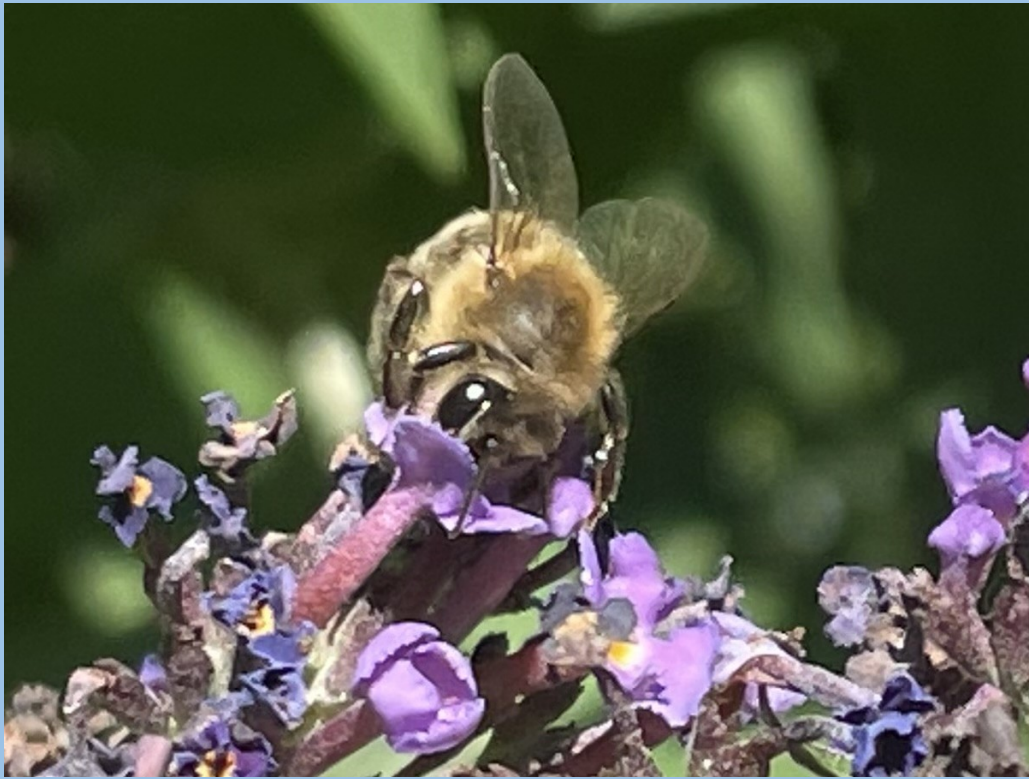
July 12 - Buddleia davidii, Berryton, KS