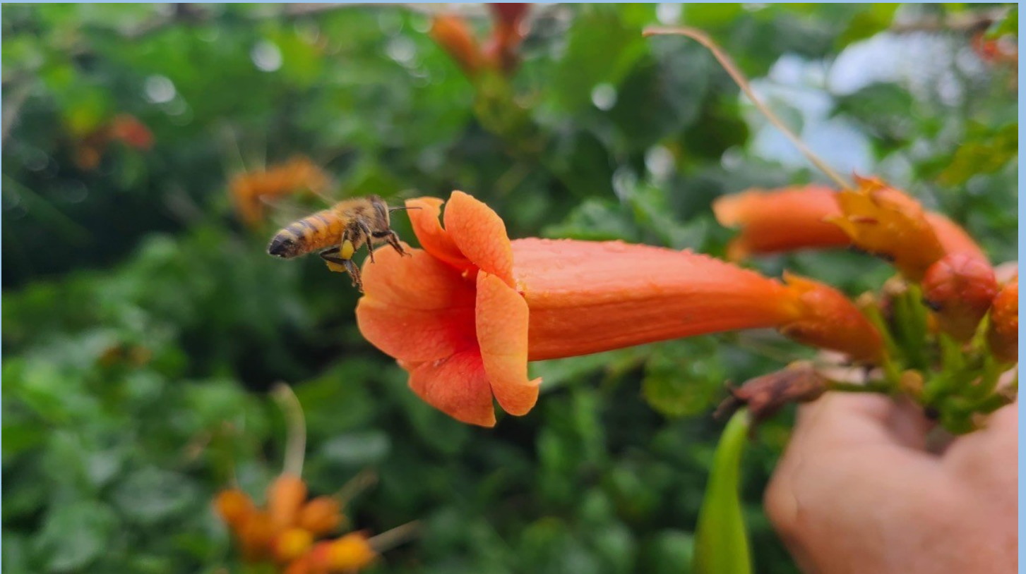
July 6 – Trumpet Vine, Wellsville, KS