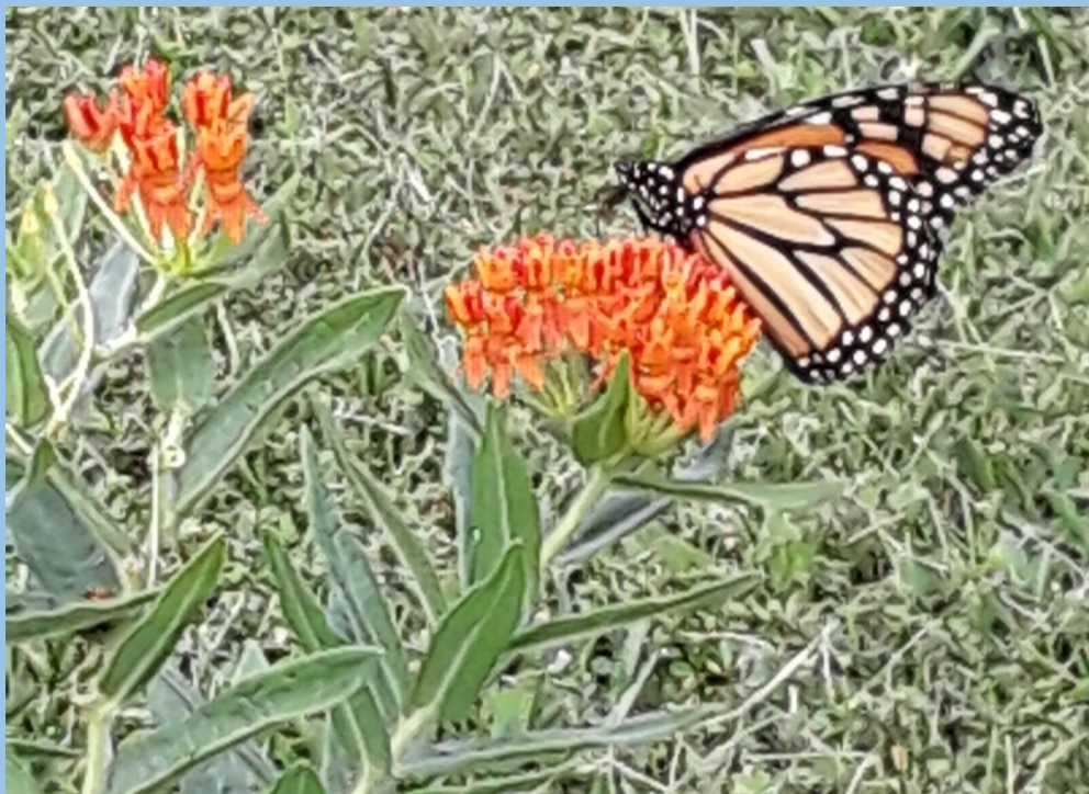
July 29 – Butterfly weed, Tonganoxie, KS