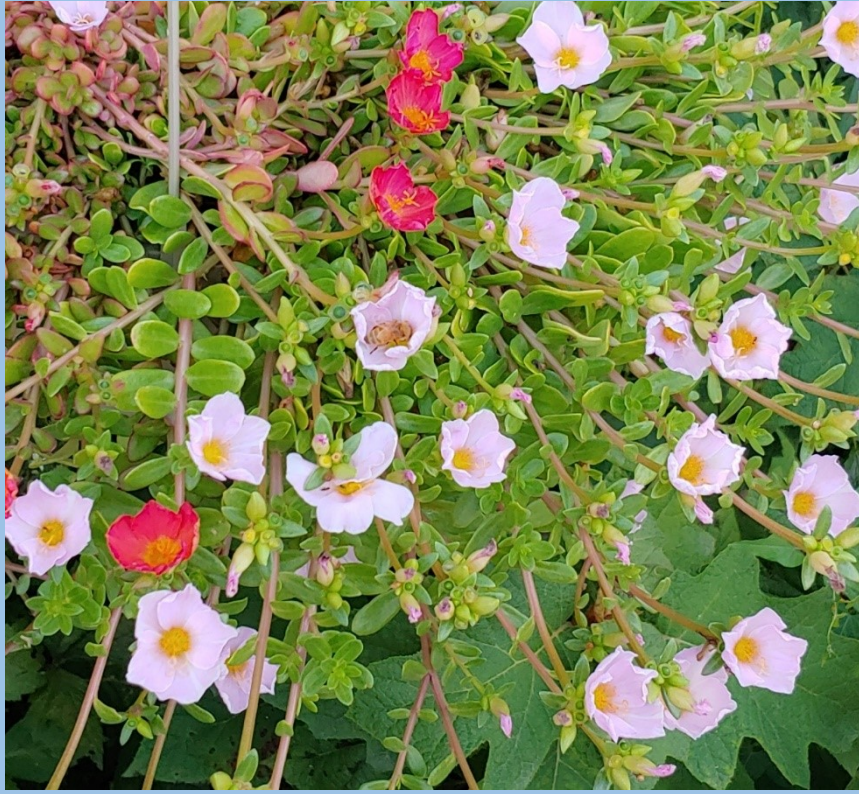
July 19 – Purslane, Olathe, KS