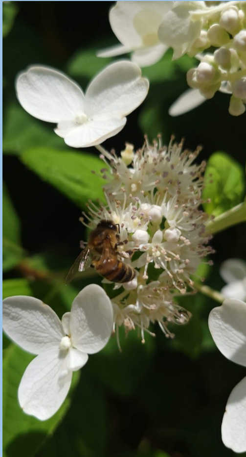
July 27 – Hydrangea, KC, MO