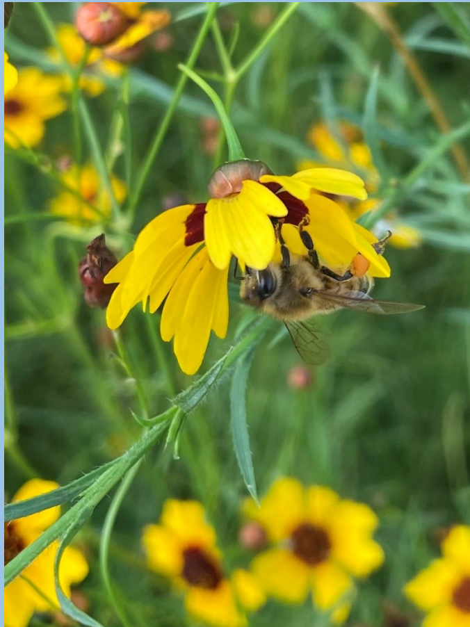
July 15 – Plains Coreopsis, Berryton, KS