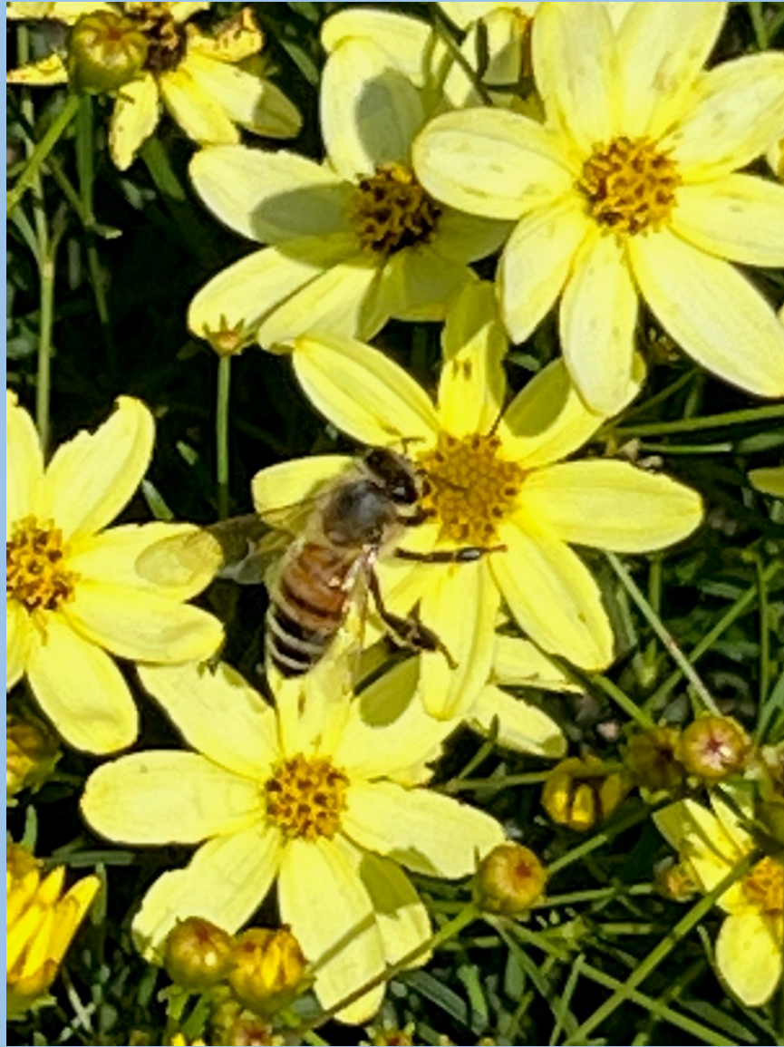
August 1 – Moonbeam Fernleaf Tickweed, Auburn, KS