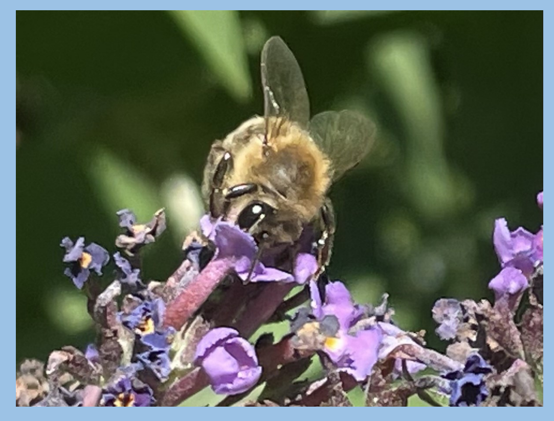
July 12 - Buddleia davidii, Berryton, KS