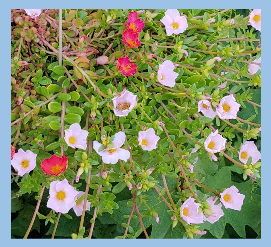
July 19 – Purslane, Olathe, KS