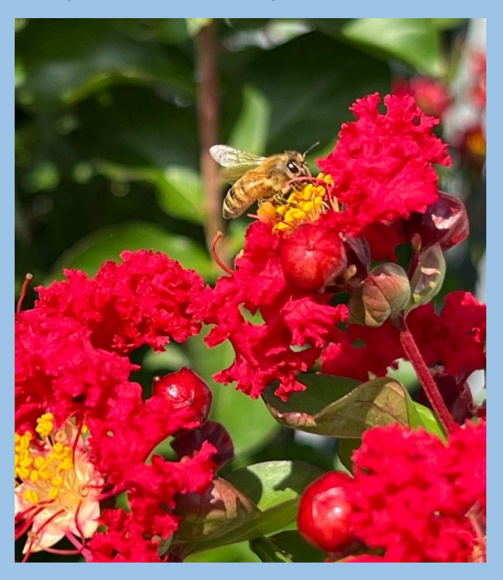
July 25 – Crepe Myrtle, Auburn, KS