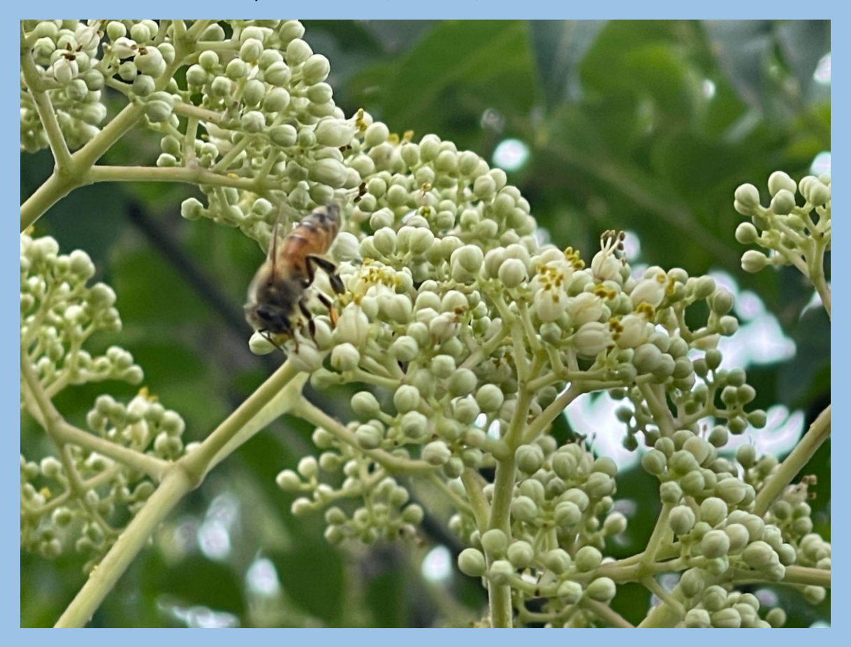
July 29 – Bee Bee Tree (Korean evodia), Ferrelview, MO