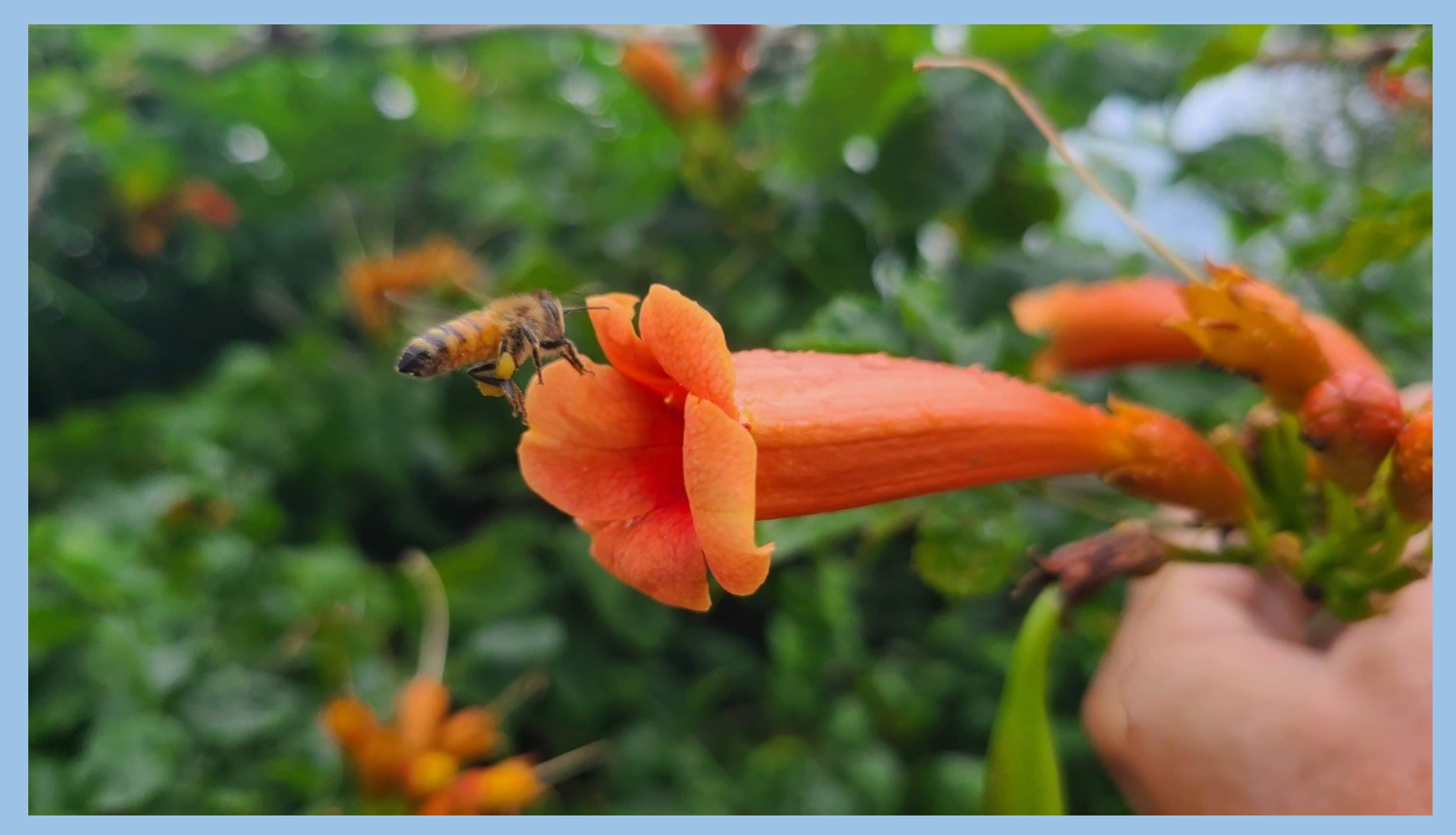
July 6 – Trumpet Vine, Wellsville, KS