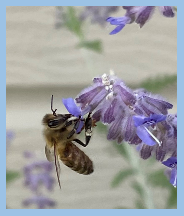
July 12 – Russian Sage, Berryton, KS