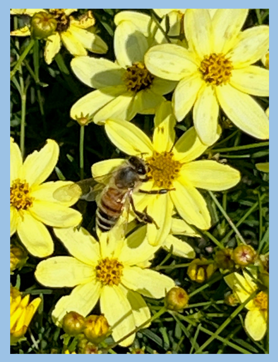
August 1 – Moonbeam Fernleaf Tickweed, Auburn, KS