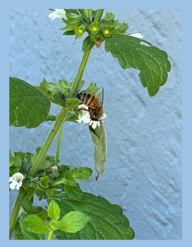
July 4 – Lemon Balm, Auburn, KS