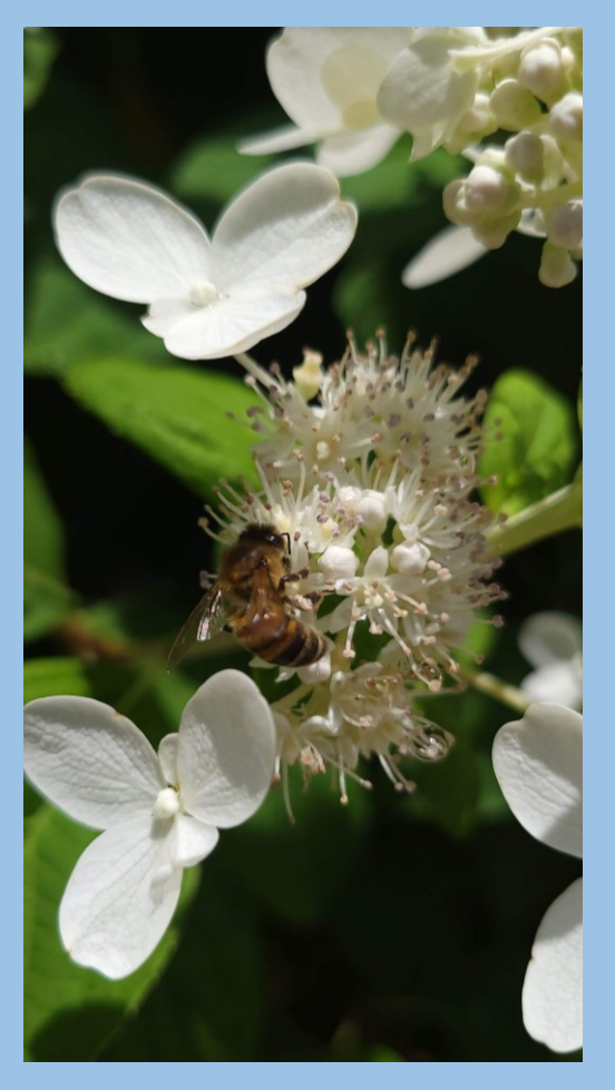
July 27 – Hydrangea, KC, MO