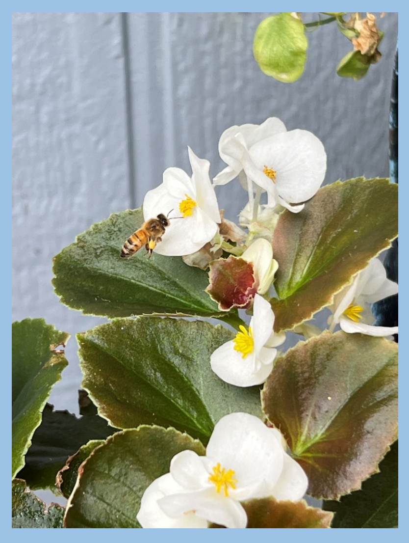
July 29 – Begonia, Auburn, KS