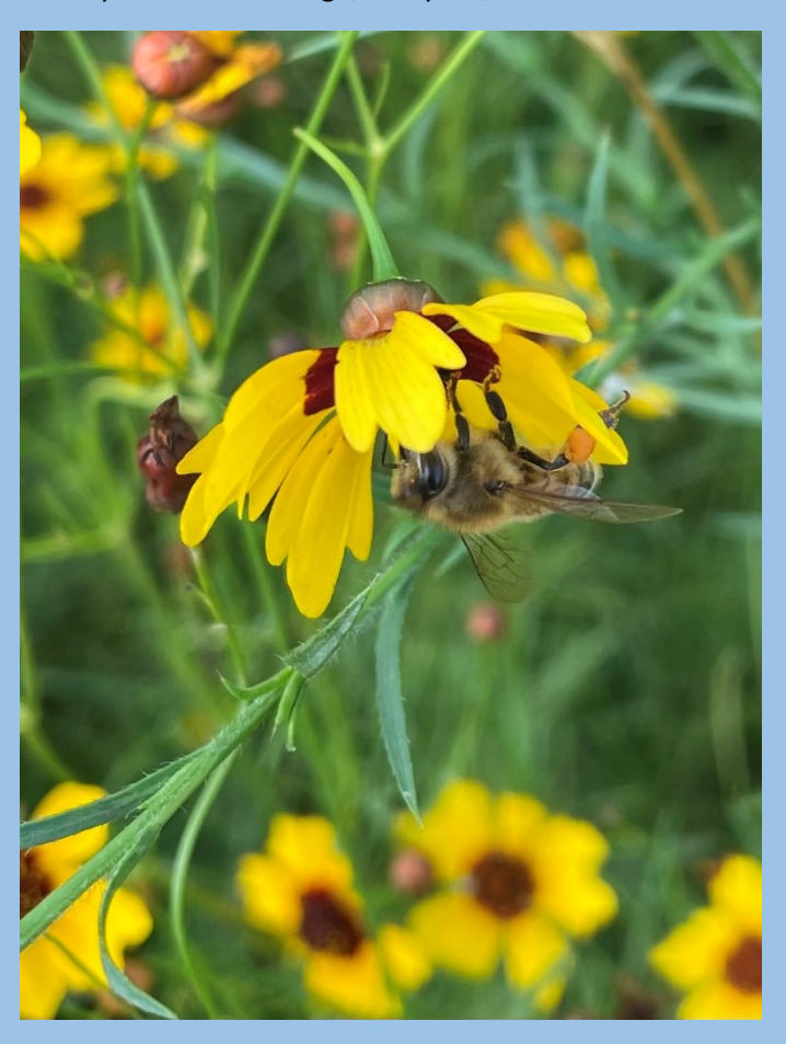
July 15 – Plains Coreopsis, Berryton, KS