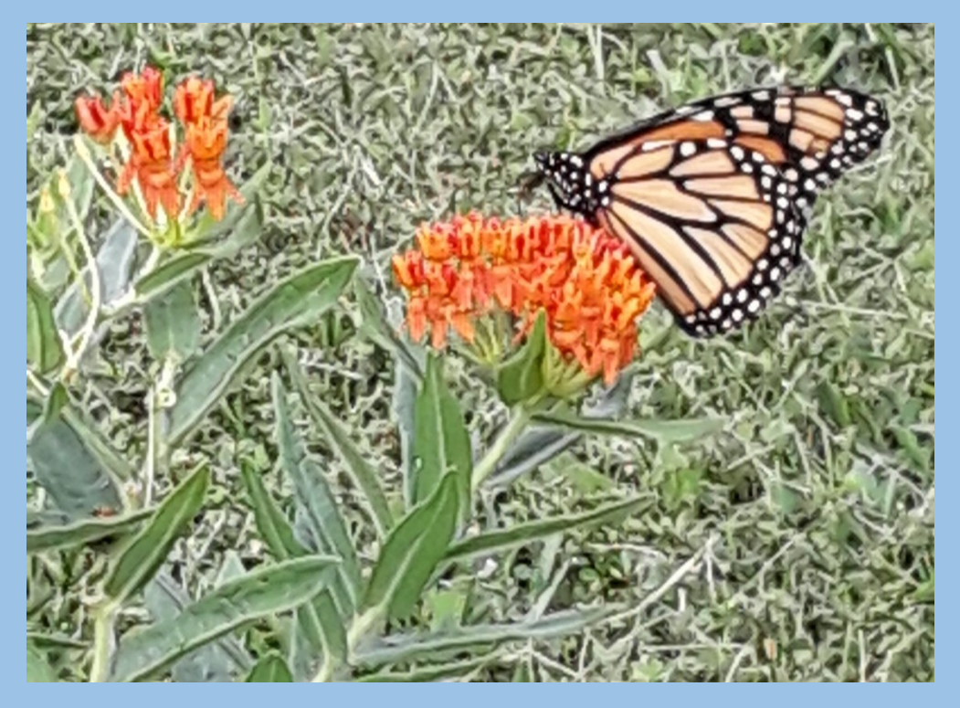
July 29 – Butterfly weed, Tonganoxie, KS