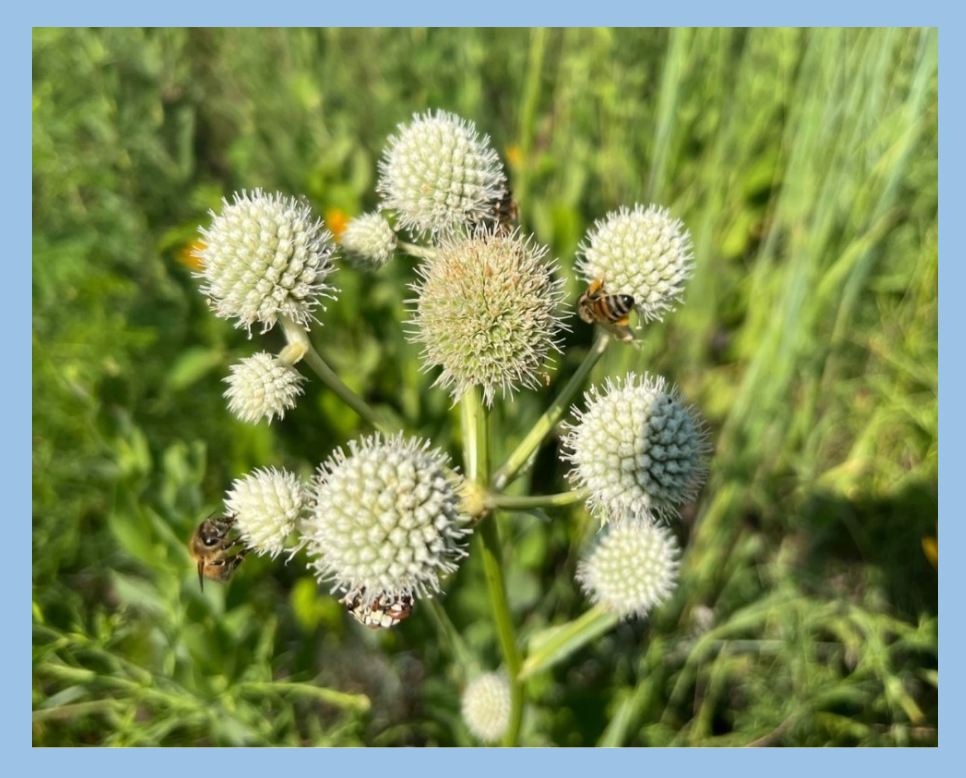
July 17 – Rattlesnake Master, Berryton, KS