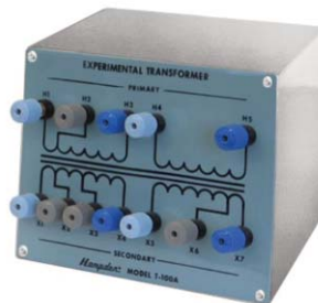
Dimensions: 7" H x 9" W x 7" D Shipping Weight: 15 lbs

The Model AT-100 is a multi-tapped autotransformer rated 240 volt-amperes at 60Hz, which may be used either for stepping up or stepping-down voltages. For convenience, the no-load voltage values are silkscreened on the front.