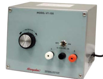
Dimensions: 7½" H x 9" W x 7" D Shipping Weight: 20 lbs

The Model T-100A is a single-phase transformer with two secondaries; rated 120 volt-amperes at 60Hz. Several of these transformers may be interconnected to demonstrate series, parallel, or three-phase configurations.