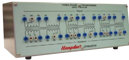
Dimensions: 7½" H x 19"W x 8½" D Shipping Weight: 40 lbs

The Model ET-100 is a double-wound, multi-tapped, single-phase transformer rated 120 volt-amperes at 60Hz. It can be used as an isolation or autotransformer. Each tap is circuit breaker protected. Multiples of these transformers may be interconnected to demonstrate parallel, Scott, Wye, and Delta configurations. Furnished complete with cords.