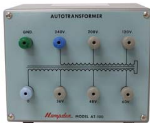
Dimensions: 7" H x 9" W x 7" D Shipping Weight: 15 lbs

The Model CT-100A is an encapsulated secondary winding used to isolate instrumentation from the primary circuit, or to step-down current to match instrument ranges. The basic range is 200:5 Amp with other current ratios depending on the number of loops formed by the primary circuit conductor around the core.