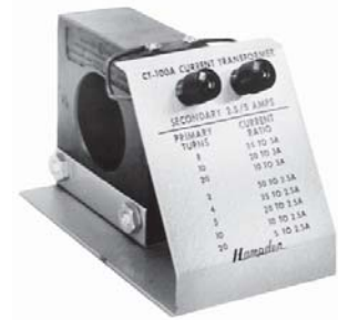
Dimensions: 5" H x 4½" W x 7½" D Shipping Weight: 10 lbs

The Model T-100-3A contains three transformers of the type used in the Model ET-100 and T-100A . All transformer leads terminate at socket receptacles on the front panel. Standard symbols and legends are silkscreened on the panel. Each of the three transformers in the Model T-100-3A may be used independently or the three may be interconnected into wye and delta configurations.