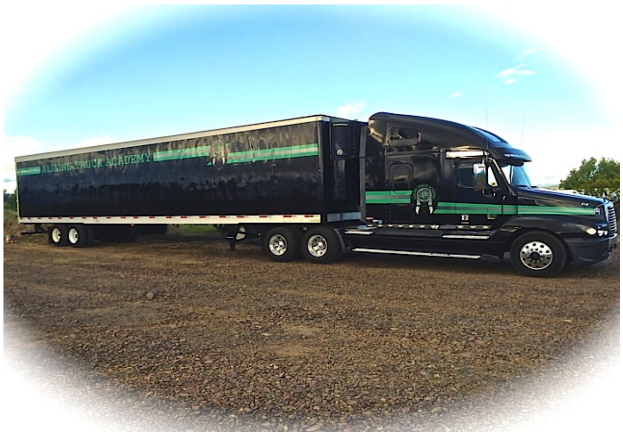
CATALOG EFFECTIVE JANUARY 1<sup>ST</sup> 2018 THROUGH DECEMBER 31<sup>ST</sup>, 2018 4<sup>th</sup> EDITION