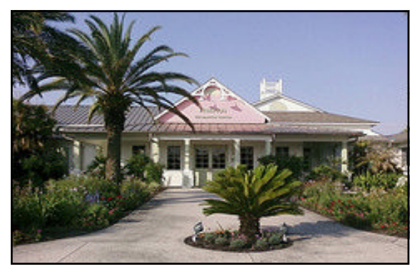
MEETING PLACE OF THE VILLAGES SHRINE CLUB Hibiscus Recreation Center 1740 Bailey Trail, The Villages, FL