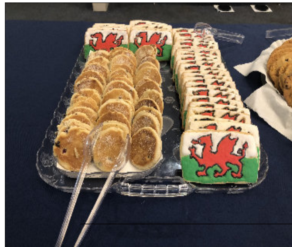
Welsh Tea Cakes and Cookies with the red dragon at the Tê Bach following the Gymanfa.