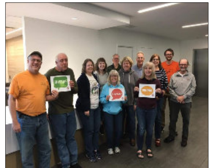
WSCO members holding signs of Welsh greetings for a photo in the Welsh-language class at the Dublin library.