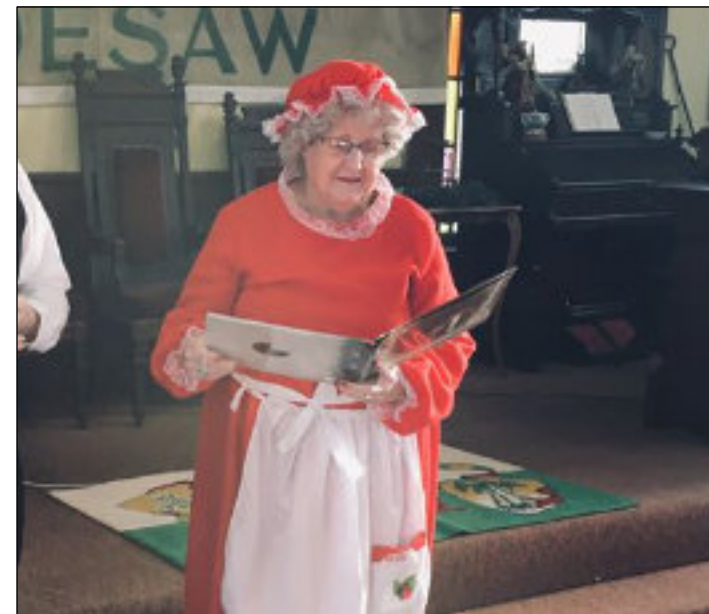
Mrs. Claus reads a Christmas story.

Following the event was a têt bach with Welsh cakes and cookies.