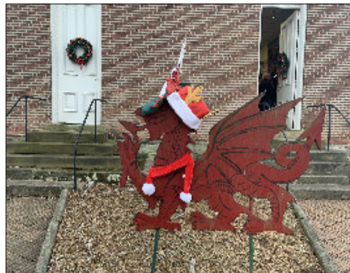
The dragon at the door of the museum at Oak Hill.