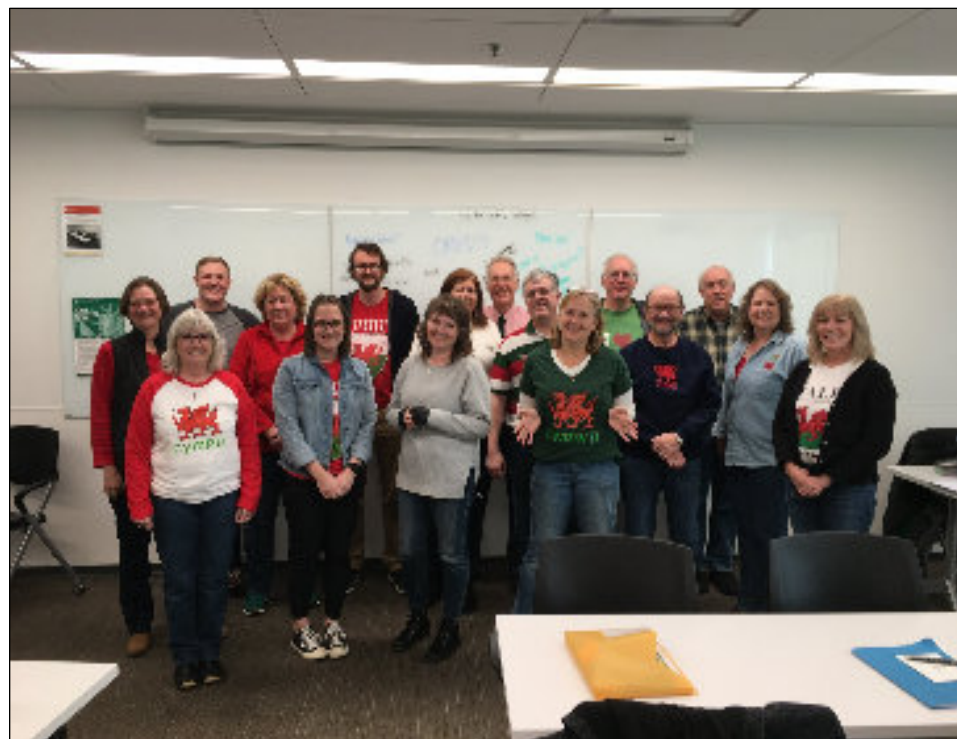
WSCO members, many wearing their best Welsh-themed shirts, pose for a photo on the last day of the Welsh-language class at the Dublin library.