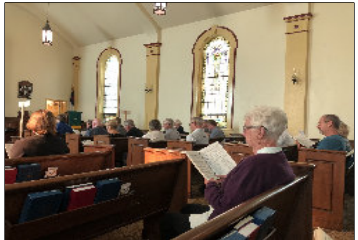
WSCO members singing Calon Lân at the 2019 Gymanfa.

This was followed by welcomes from pastor