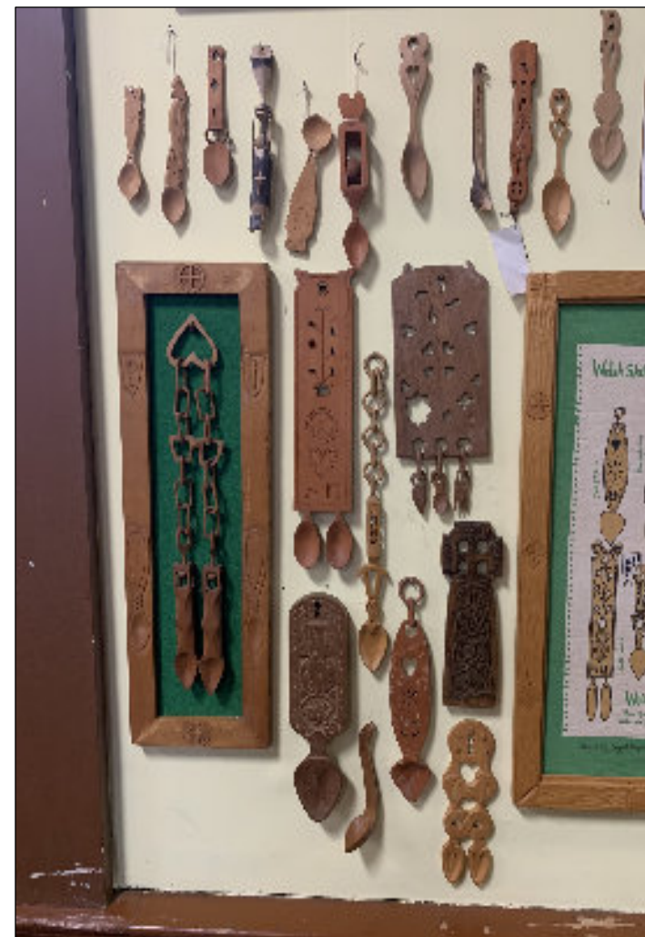
Welsh Love Spoons on Display in the Museum at Oak Hill.