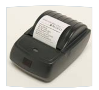
Printer Kit (optional)

The 12 frequency protocol will only appear on DP Standard or Combo Diagnostic instruments (supported by both OAE and Tymp probes). The Acoustic Reflex capability is available for any configuration of instrument, but requires a Tymp probe.