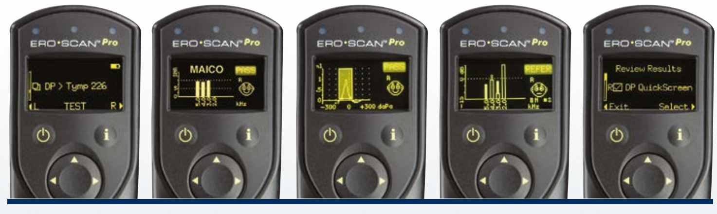
Choose test to run (ie, linked OAE & Tymp)