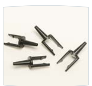
Probe Tips (external)