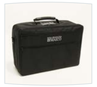
Carrying Case (optional)