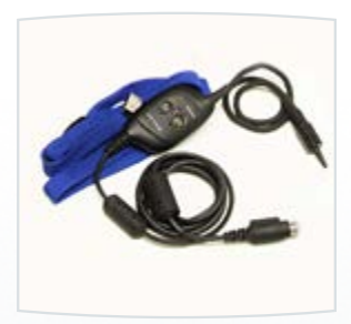
OAE External Probe