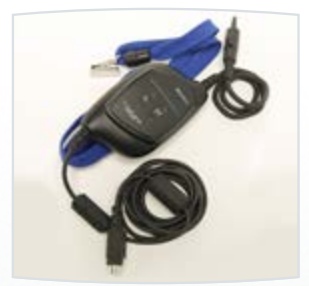
Tymp/OAE External Probe (optional)