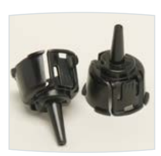
Probe Tips (internal)