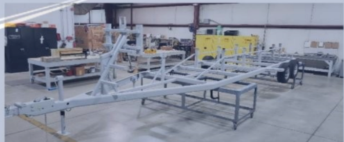
Figure 2 Post Paint